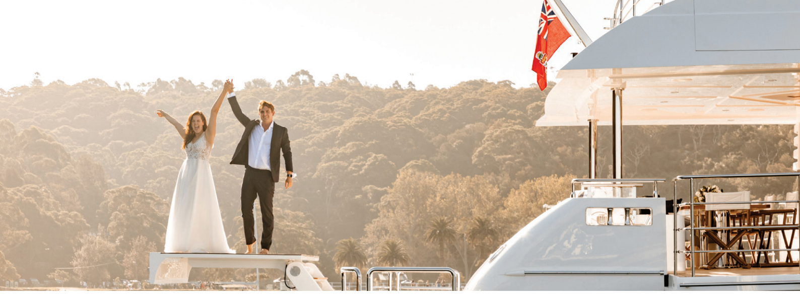
COCKTAIL - UP TO 100 GUESTS